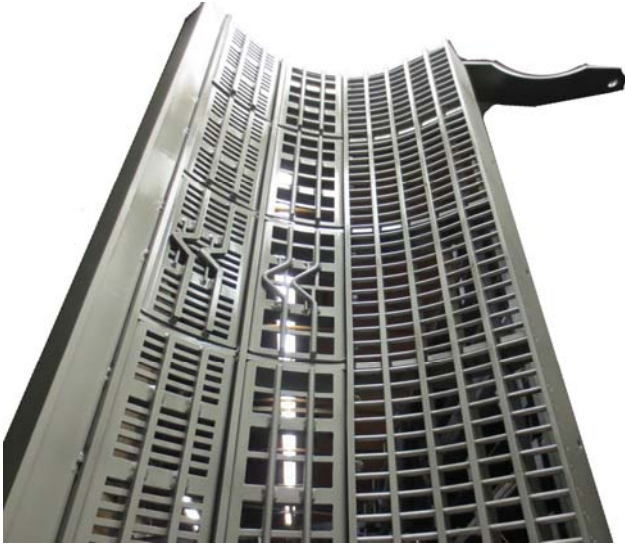
Concave showing both small grain and large grain boxes installed to show the difference.

Nothing says heavy-duty like 3/8" by 2.5" C1045 US milled flashbar spanning the width of a concave 9 times. Now you can bolt in boxes that act as bridgework rather than having wire/holes weaken the structure and spear straw. That will fix the center point fatigue and "smile" indicating premature concave failure.